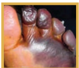
Smoker's Gangrene (Buerger's disease)